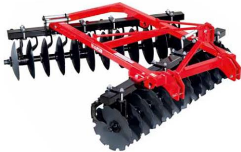
V TYPE DISC HARROW