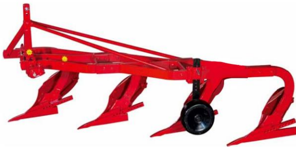
CONVENTIONAL PLOUGH WITH BAR POINT