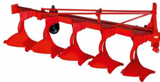
PROFILE CHASSIS PLOUGH