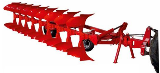
SEMI-MOUNTED REVERSIBLE PLOUGH