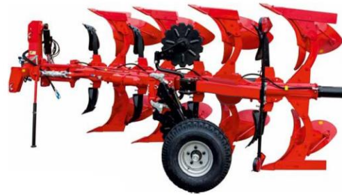
REVERSIBLE PLOUGH WITH HYDRAULIC SAFETY