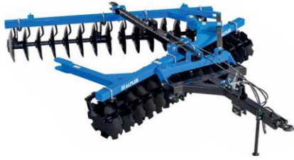
MOUNTED AND TRAILED V TYPE DISC HARROW (LIGHT MODEL)