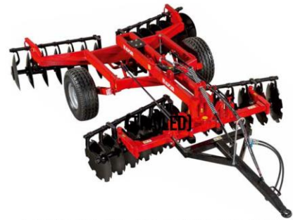
TRAILED X TYPE DISC HARROW