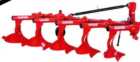
AUTOMATIC PLOUGH WITH SPRING SAFETY