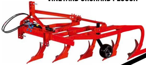
VINEYARD ORCHARD PLOUGH