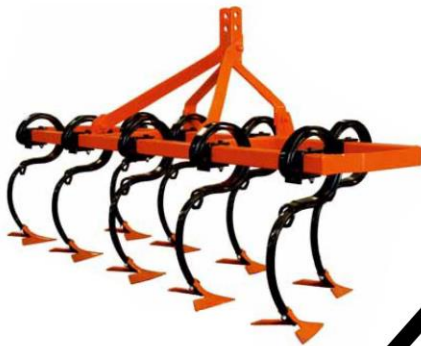
SPRING TINE CULTIVATOR