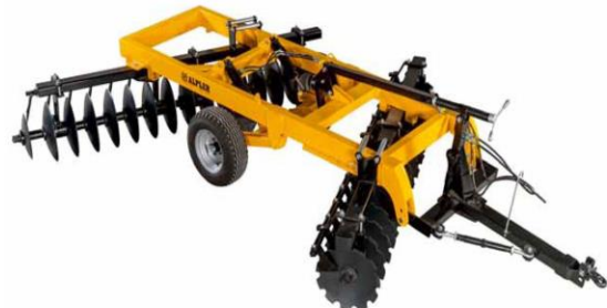
TRAILED V TYPE HEAVY DISC HARROW