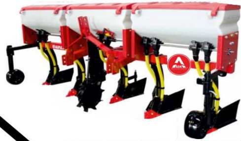
DIRECT FERTILIZER MACHINE