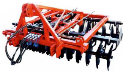
MOUNTED X TYPE DISC HARROW