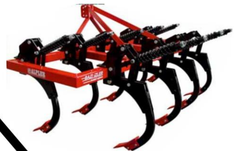
CHISEL PLOUGH WITH SPRING