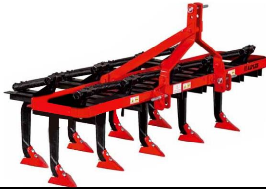
SPRING CULTIVATOR LIGHT MODEL