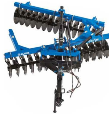
MOUNTED AND TRAILED V TYPE DISC HARROW