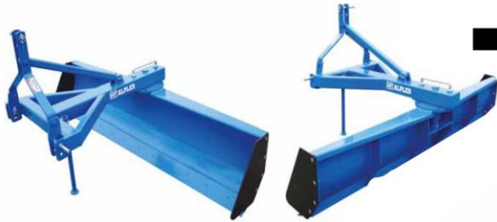
REAR BLADE (LIGHT MODEL)