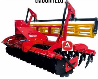
COMPACT DISC HARROW (MOUNTED)