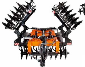
TRAILED V TYPE HEAVY DISC HARROW (FOLDING)