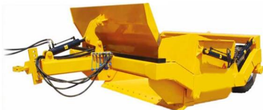
BOX LEVELER MACHINE